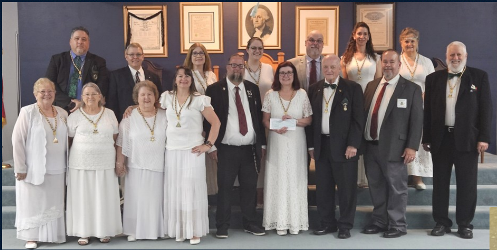
WP Lodge visits OES Pioneer Chapter 99 and presents a donation check