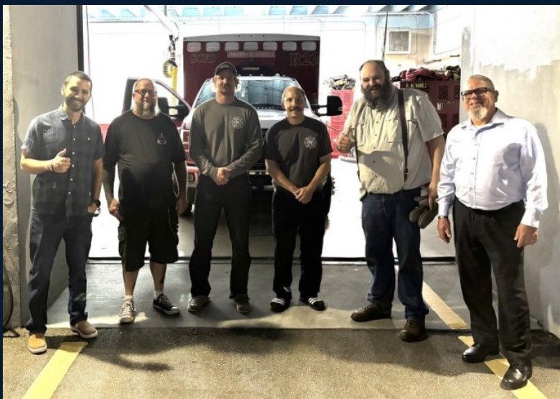
Delivering a Thanksgiving meal to the Fire Department